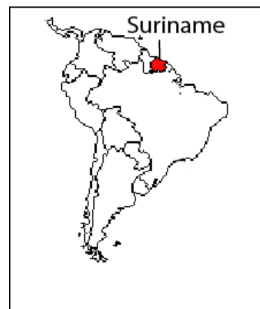
Figure 1.1 Suriname in Latin America

The Republic of Suriname is situated between 2-6 0 Northern latitude and 54-58 0 Western longitudes in the Northern part of South America. The capital is Paramaribo. Suriname borders are the Atlantic Ocean in the north, Brazil in the south, Guyana in the west and French Guiana in the east. The total area of Suriname is 163,820 km 2 , which consists of a swampy coastal plain, a central plateau region containing broad savannahs and swamp forests, and to the south a highland region with dense tropical rainforest. The country has a typical tropical climate, a mean daily temperature about 27 0 C and an annual average rainfall varying from 1900 mm along the coast and 2700 mm in the center of the country. There are two wet seasons from April to August and from November to February as well as two dry seasons from August to November and February to April.