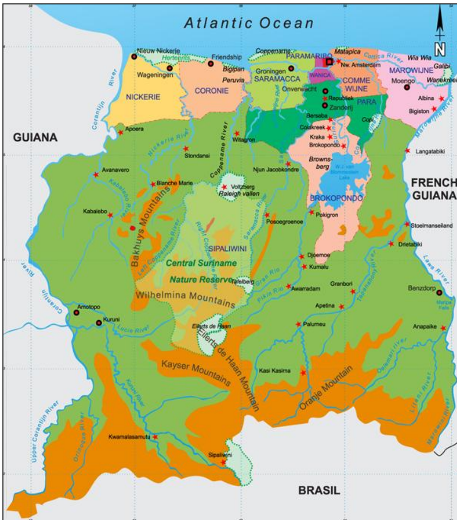
Figure 1.2 Map of Suriname divided in 10 districts

The economy is dominated by the mining industry, with exports of alumina, gold, and hydrocarbons accounting for about 85% of exports and 25% of government revenues, making the economy highly vulnerable to mineral price fluctuations. Other export products include bananas, shrimp and fish, rice, and lumber. After mining and extraction, the major industrial sectors in Suriname are manufacturing (food industry, textile and clothing goods, wood-, plastic- and paper products, metal works and other manufacturing) and agriculture.